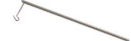
181003 I.V. pole extension including blocking screw