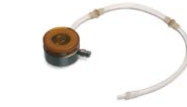
117002 ACS3 device for Pulsar