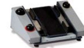
112101 Dual linear footpedal