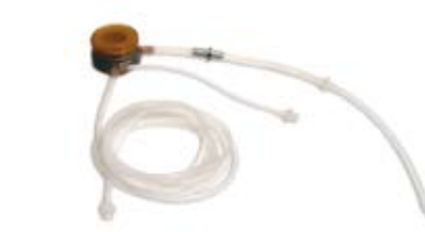
117001 I/A tubing set with ACS3 device for Pulsar