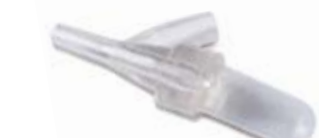
191004 Kiss (Kawano Irrigation Surge Suppressor), single-use (20 pcs)