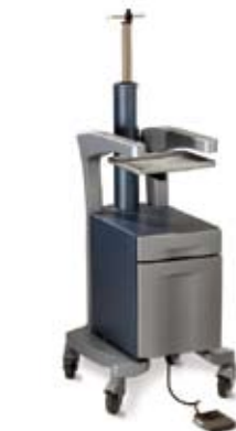
181004 Equipped motorized cart