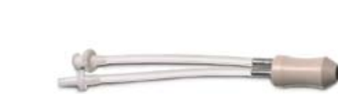
114102 I/A handpiece, short barrel