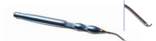
114304 Irrigating chopper