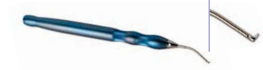
114303 Irrigating nucleus manipulator