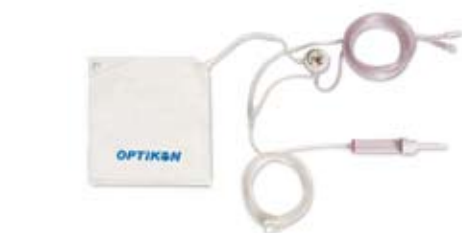
191702 I/A tubing set for Pulsar with ACS3 device and drainage bag (single-use, sterile, 10pcs)