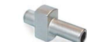
113402 Phaco tip wrench