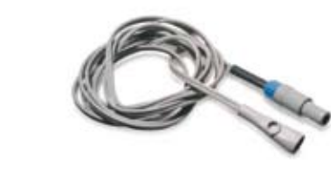
115101 Diathermy bipolar cable