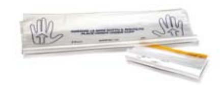
191602 Screen & Mayo drape single-use (5pcs)