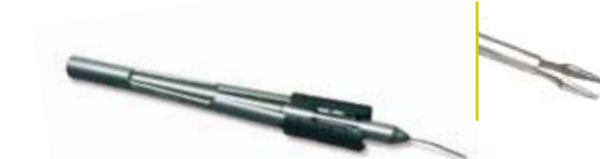
116006 Capsulorhexis forceps