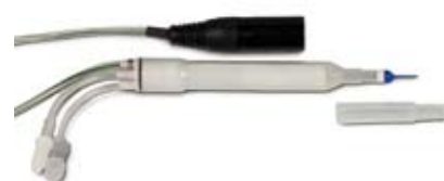
Phaco handpiece single-use (2 crystals, single-use, sterile, 5 pcs, requires adaptor REF 116005)