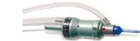
123002 Anterior vitrectomy probe, w/silicone sleeve

On demand single-use phaco packs for Pulsar (10pcs) including I/A tubing set for Pulsar, screen drape, Mayo drape, test chamber, sleeve (to customer choice).