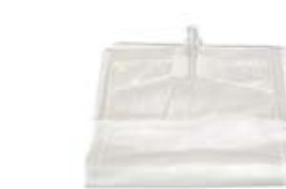
116002 Drainage bag (10pcs)