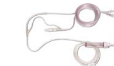
191701 I/A tubing set for Pulsar (single-use, sterile, 10pcs, to be used with ACS3 device REF. 117002)