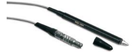
153003 20 MHz straight pachymetry probe