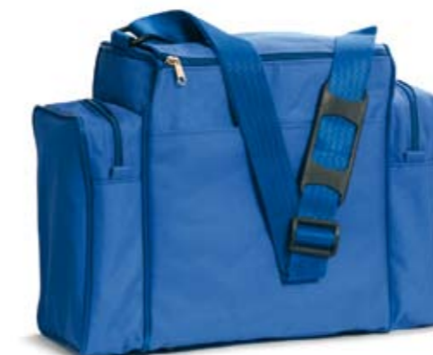
149004 Bag for biometer/pachymeter