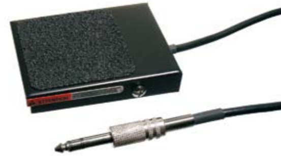
142003 Footswitch for biometer and pachymeter