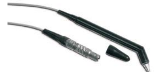
153004 20 MHz angled pachymetry probe