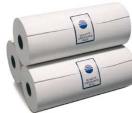
149003 Thermal paper (3 rolls)