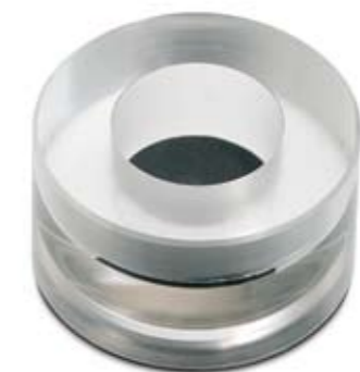
159001 Pachymetry tester