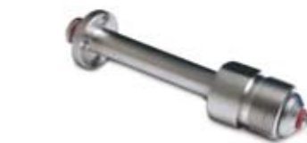
132010 N 2 O cylinder adapter (French standard)