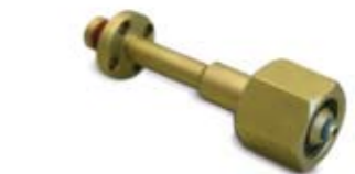
132009 CO 2 cylinder adapter (ISO5145 standard)