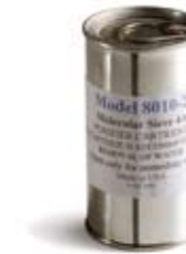
132005 Spare cartridge for gas filter