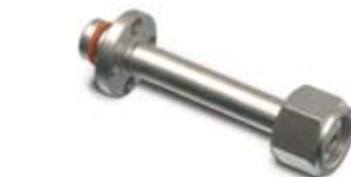
132008 N 2 O cylinder adapter (ISO5145 standard)