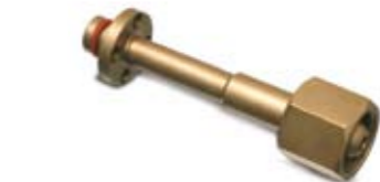
132006 CO 2 cylinder adapter (Chinese standard)