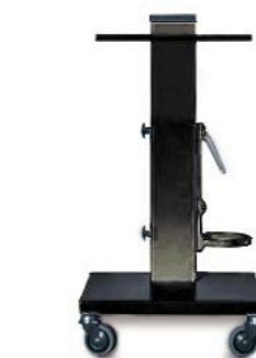
183001 Trolley for Cryoline with cylinder holder