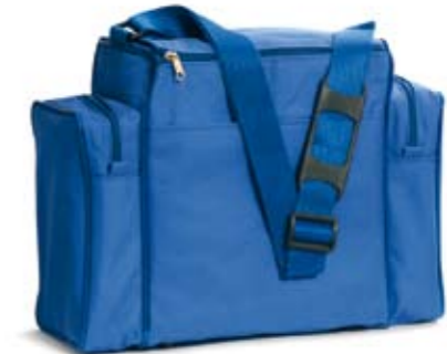
149004 Bag for biometer/pachymeter