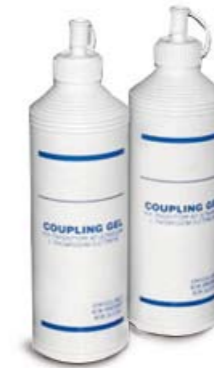
149005 Gel tube, 250 ml (2 pcs/box)