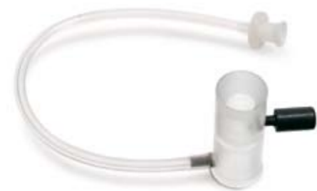
149006 Cup for immersion biometry, Ø 14