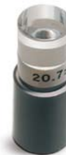
149001 Biometry tester