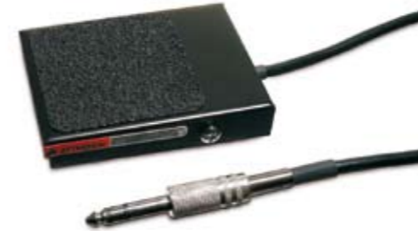
142003 Footswitch for biometer and pachymeter