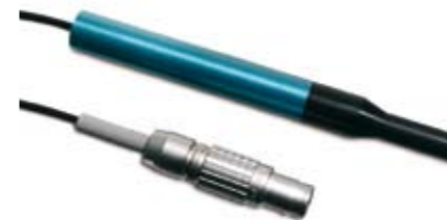
143001 10 MHz biometry probe