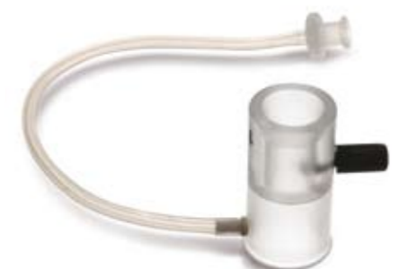
149008 Cup for immersion biometry, Ø 18